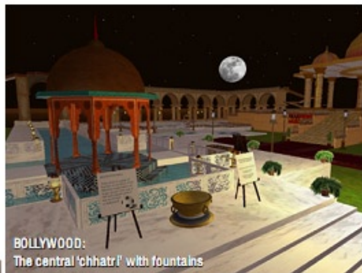
BOLLYWOOD: The central 'chhatra' with fountains

The need to attract virtual visitors, however, means that the ubiquitous camping chairs and dance pads give the sim that touch of 'SLness'.