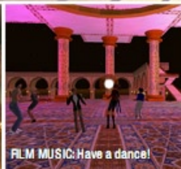
FILM MUSIC: Have a dance!